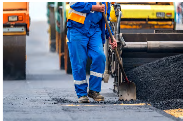
Routine maintenance, such as filling in potholes, repainting lane and edge lines, removing accumulated debris from drainage inlets, and mowing.