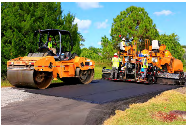
Road resurfacing that does not disturb the subsurface.

Each state permitting authority may classify new development, redevelopment, and roadway repair and improvement activities differently. DOTs typically classify their activities into new construction, reconstruction, rehabilitation, maintenance, and resurfacing. Two common examples are illustrated below.